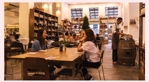
Block 9 of Dempsey Hill